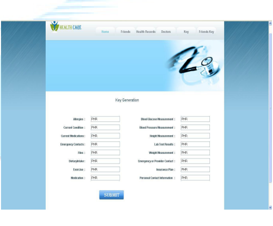
Fig 5.4 Key Generation